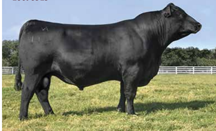
Pictured: V A R Reserve 1111 grandsire of GFAR Reserve E214