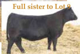
Full sister to Lot 9